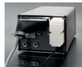
TOP: Shown with optional IP45 accessory kit for improved water protection

4: With optional buffer tank measurement, gas composition in the buffer tank can be checked before packages are flushed, providing even greater control.